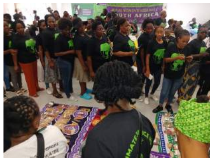
SOME OF THE SEEDS DISPLAYED AT THE HALL