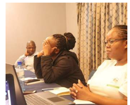
FINANCE AND ADMIN OFFICER LISTENING ATTENTIVELY DURING THE PROCEEDINGS