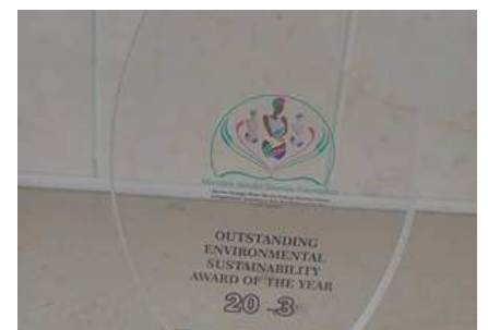
MOST OUTSTANDING ENVIRONMENTAL SUSTAINABILITY AWARD OF THE YEAR