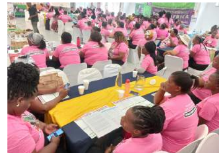
SOME OF THE PARTICIPITANTS DURING THE PRESENTATIONS