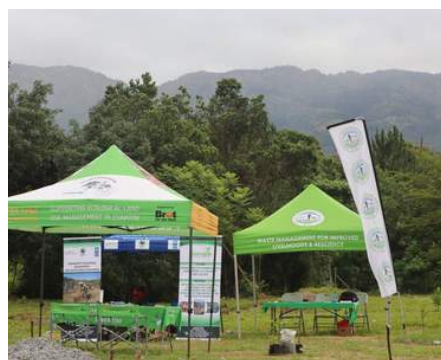
EXHIBITION SITE AT THE ATDC OPEN DAY