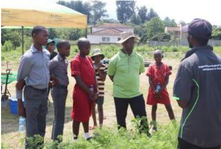
ENHLANHLENI PRIMARY AND MBABANE CENTRAL PRIMARY SCHOOL AT THE ATDC