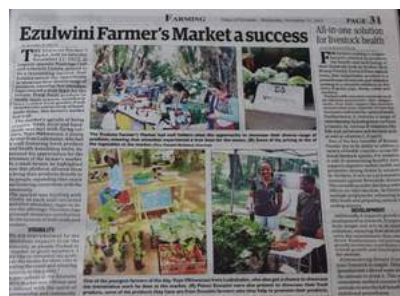
TIMES OF ESWATINI ARTICLE