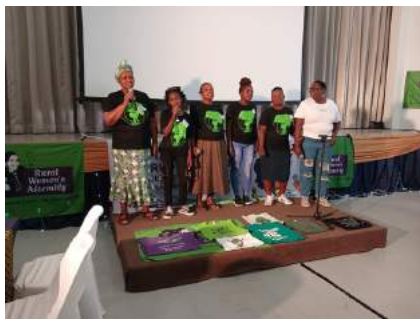
PELUM BOARD MEMBER DURING ONE OF THE PRESENTATIONS IN JORBURG